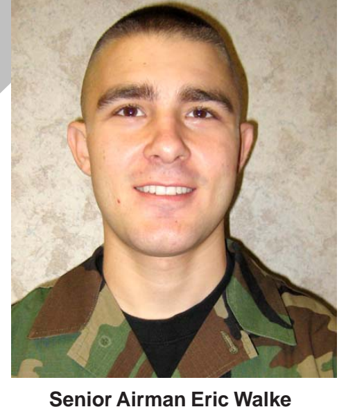
Journeyman "My favorite holiday tradition is during Christmastime. My entire family gets together and eats and has a good time."